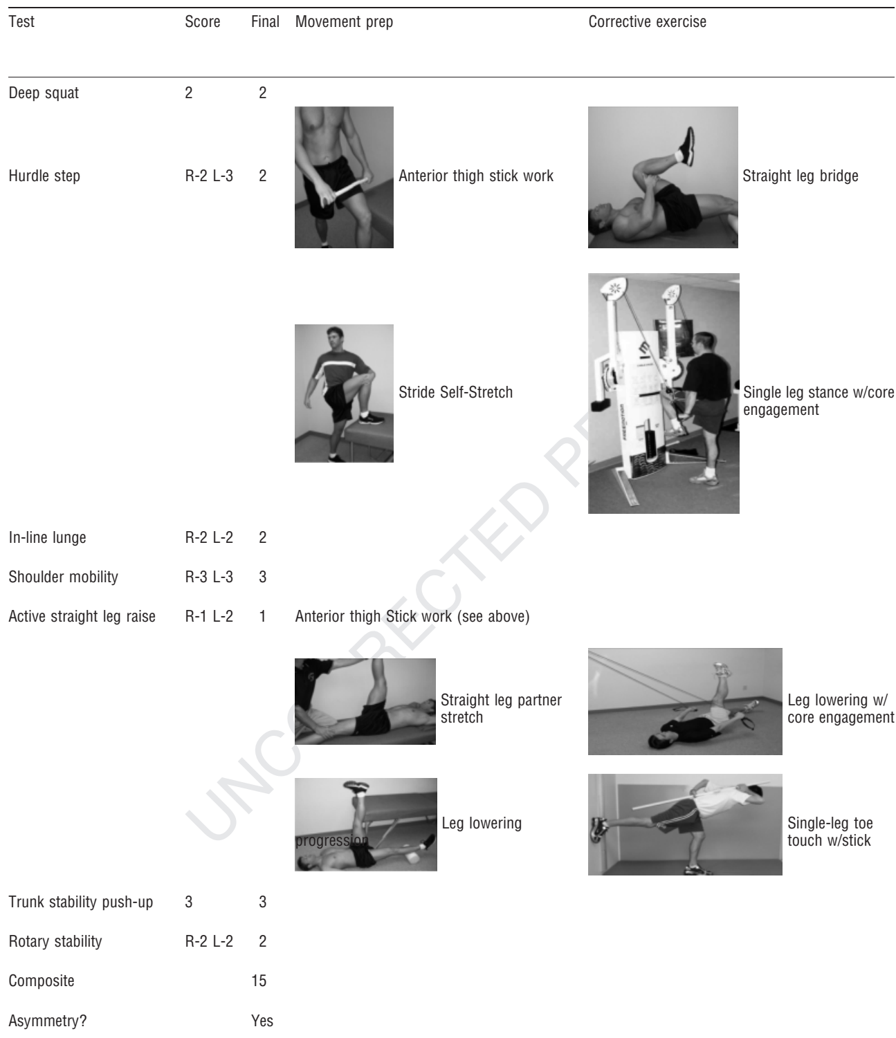
Q8 Table 1. Example of an individual off-season intervention program based on pre-test Functional Movement Screen™ score